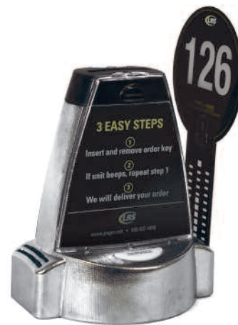
Key Call Table Top Unit with Key