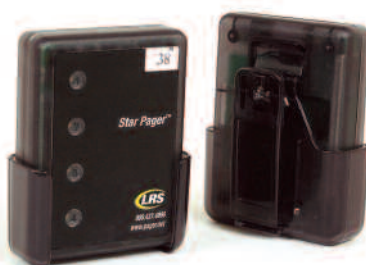
Star Pagers (shown with included cradles)