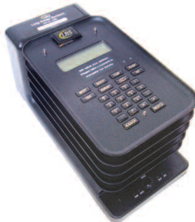
Electronic Comment Cards with Base Station