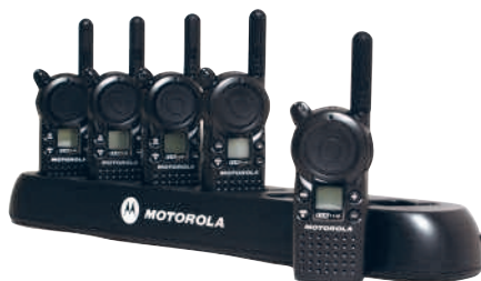
Motorola CLS with Multi-Unit Charger