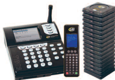
Freedom Elite Transmitter, T901 Handheld and Coaster Pagers