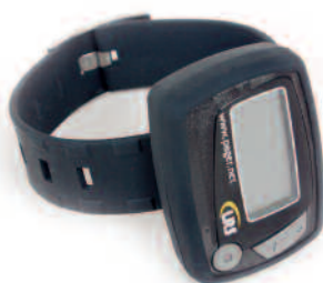
New! Silicone Wristband Sleeve