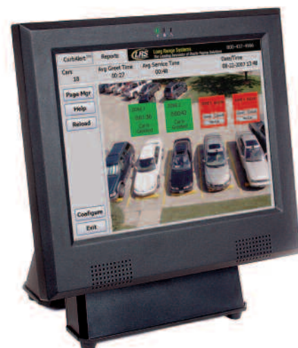
CurbAlert Touch Screen