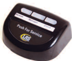
Table Top Transmitters