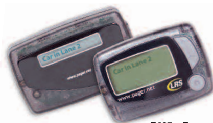
SP5 - Rechargeable (NiMH)