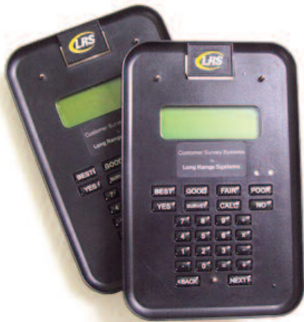
Electronic Patient Survey Trays