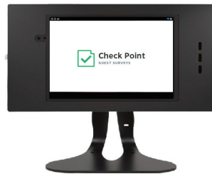
Nexus 7 Mountable Enclosure £200