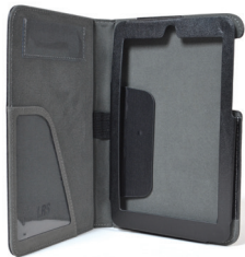
Asus/Nexus Folio £20